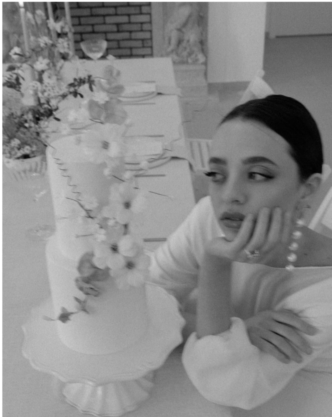
Location Casa Sacoto, Lisbon