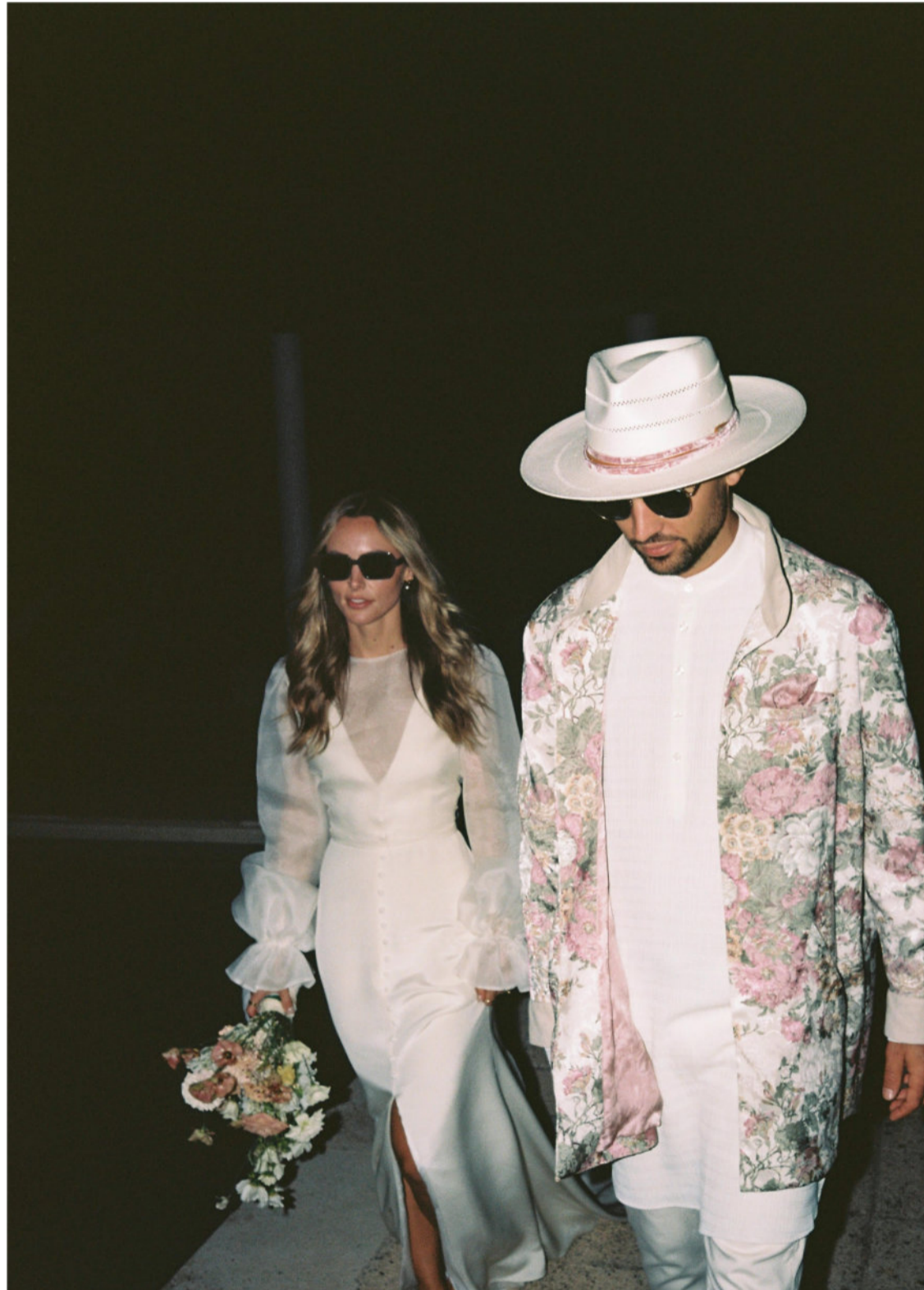
Location Casa Sacoto, Lisbon